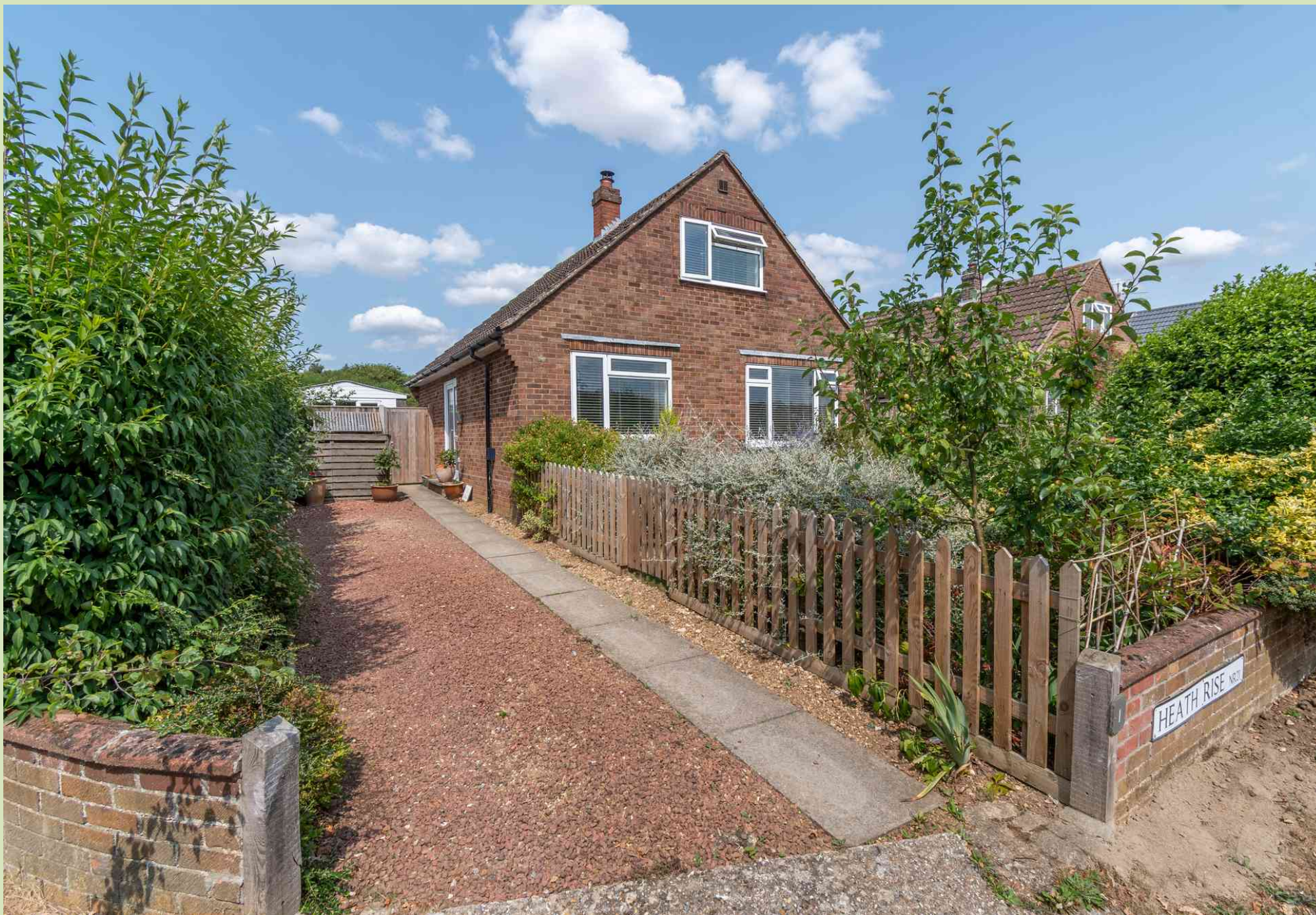
1 Heath Rise, Fakenham Guide Price £330,000