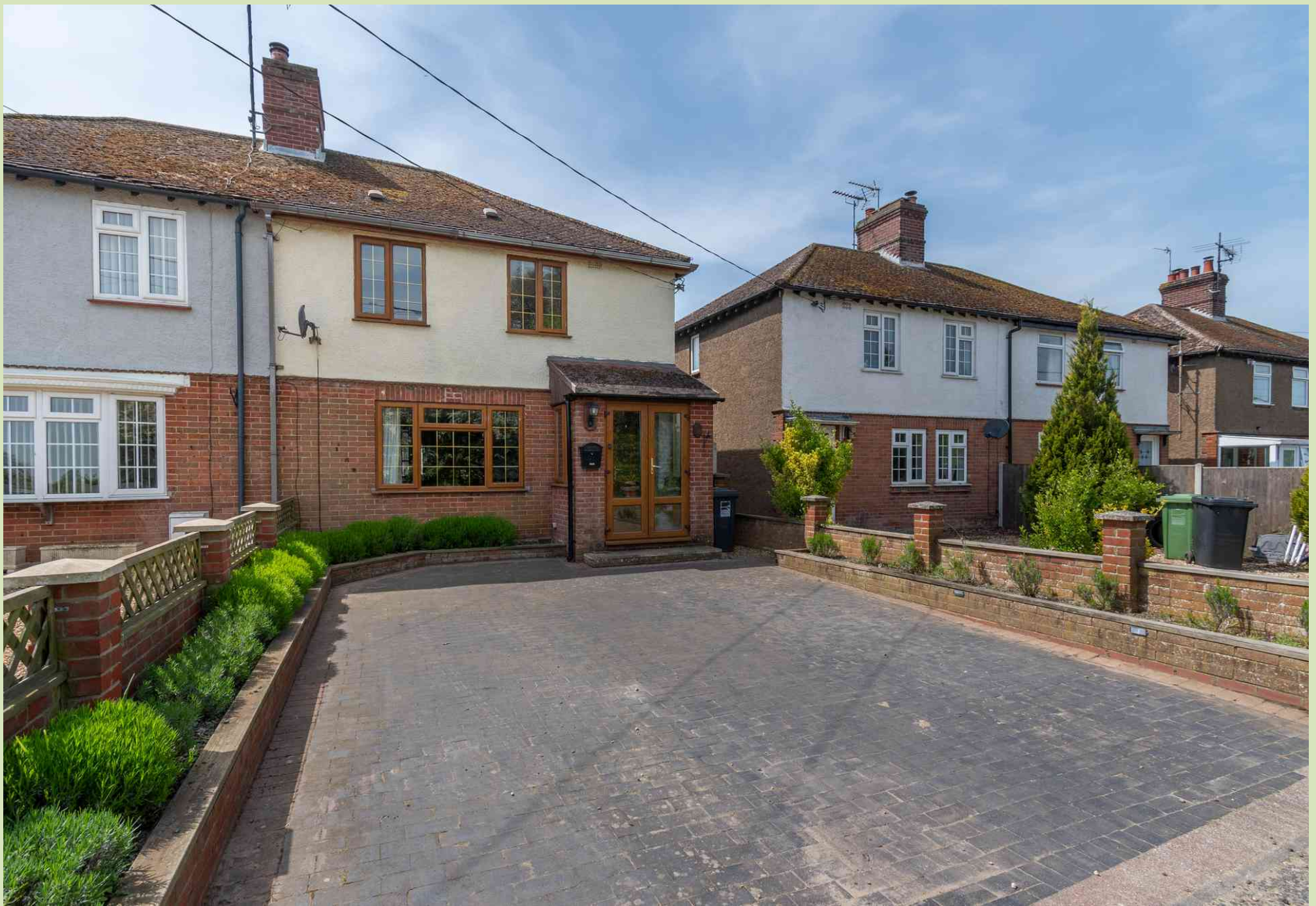
38 Dereham Road, Pudding Norton Guide Price £300,000