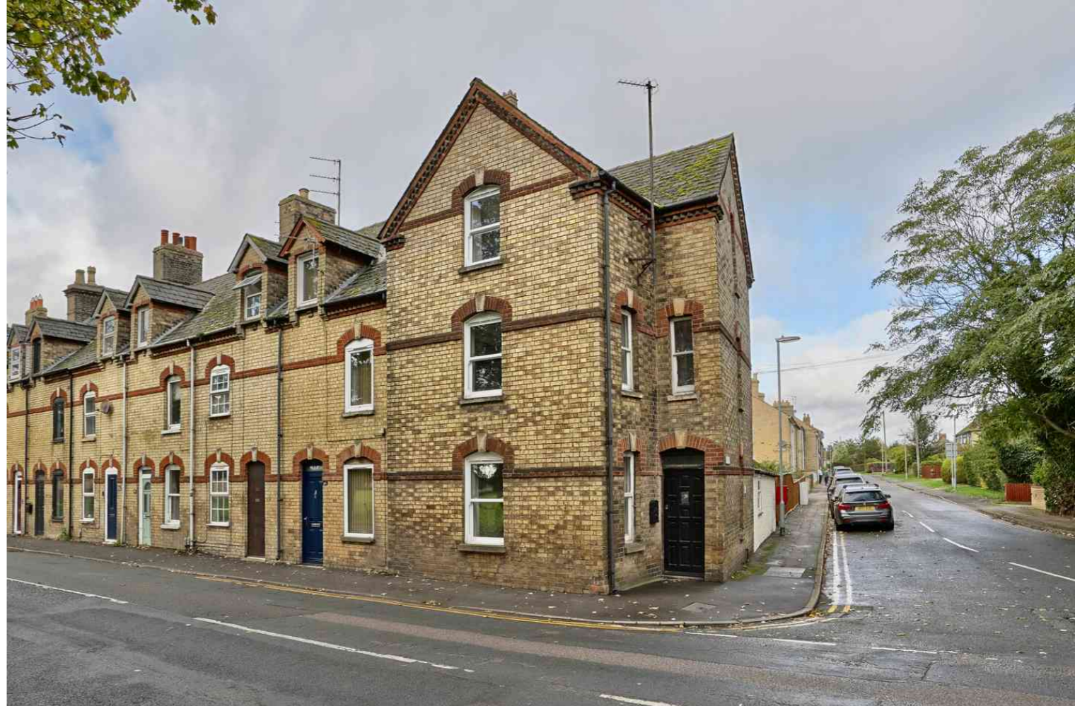
Hartford Road, Huntingdon PE29 1XG Guide Price £350,000