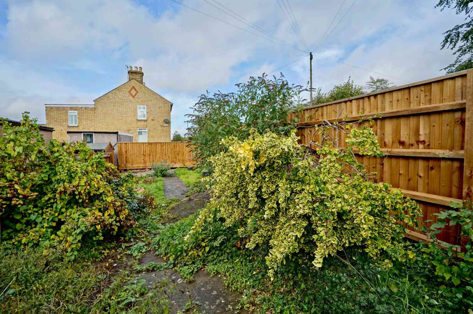
Huntingdon PE29 1XG