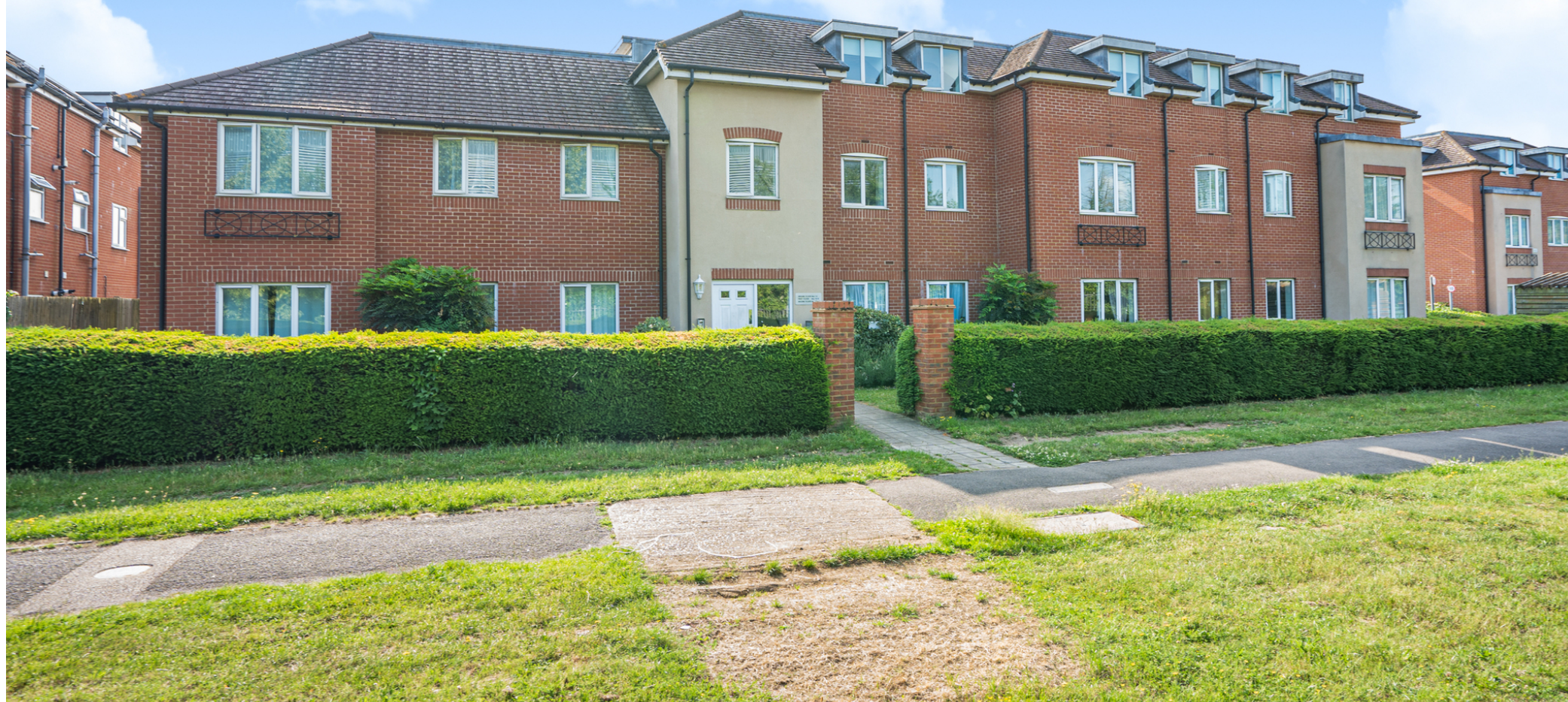
17 Dudley Place, Stanwell, Staines-upon-Thames, Surrey. TW19 7BG. 2 Bedroom Apartment - £265,000 Leasehold