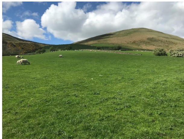
Foreground Lot3 – Background Lot 1