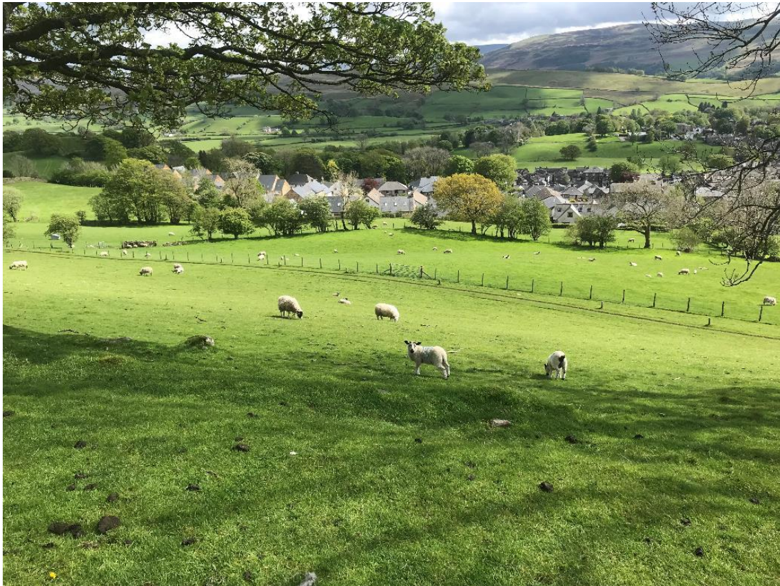
Foreground Lot 5 – Background Lot 4