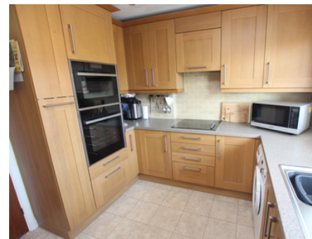
54 Station Road, Langford, Bedfordshire, SG18 9PF