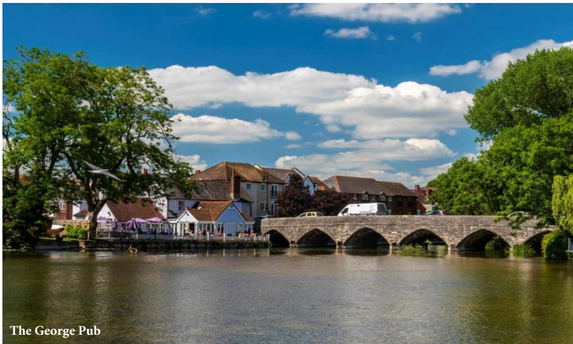
The George Pub