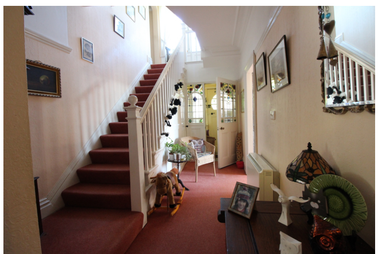
96 Banks Lane, Riddlesden, Keighley, West Yorkshire, BD20 5PQ