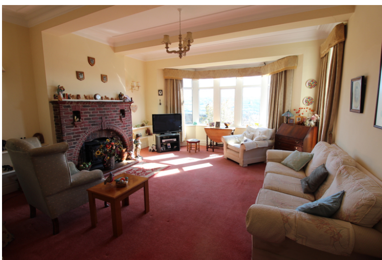
OFFERS OVER £400,000