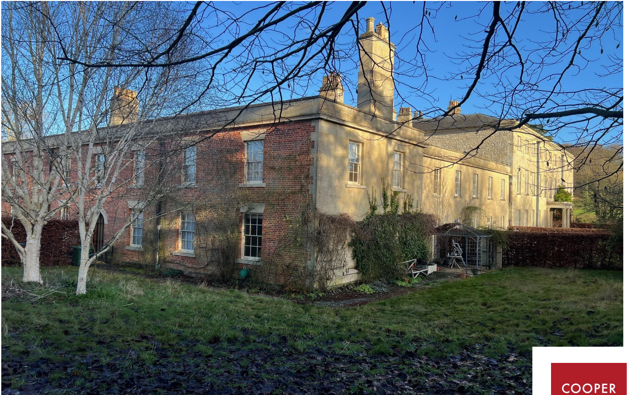
6 Heytesbury Park House, Heytesbury, Wiltshire, BA12 0HG