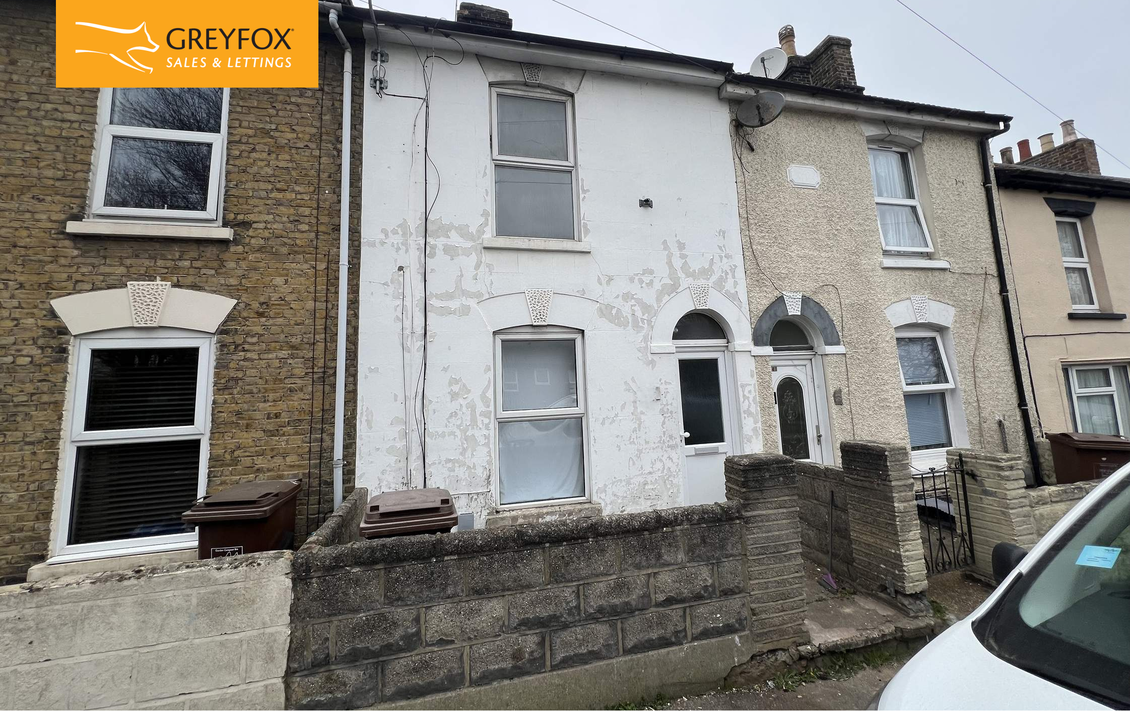
Two Bedroom Terraced House Victoria Street, Gillingham, Kent, ME7 1EJ