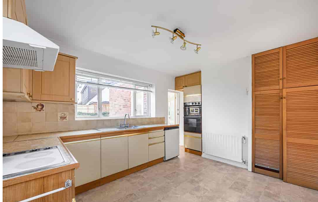
17 Edith Road, Maidenhead, Berkshire SL6 5DY Offers in Excess of £850,000 - Freehold