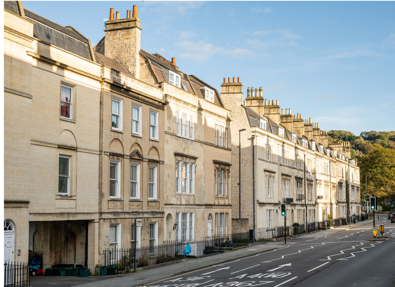
Bathwick Street, Bath