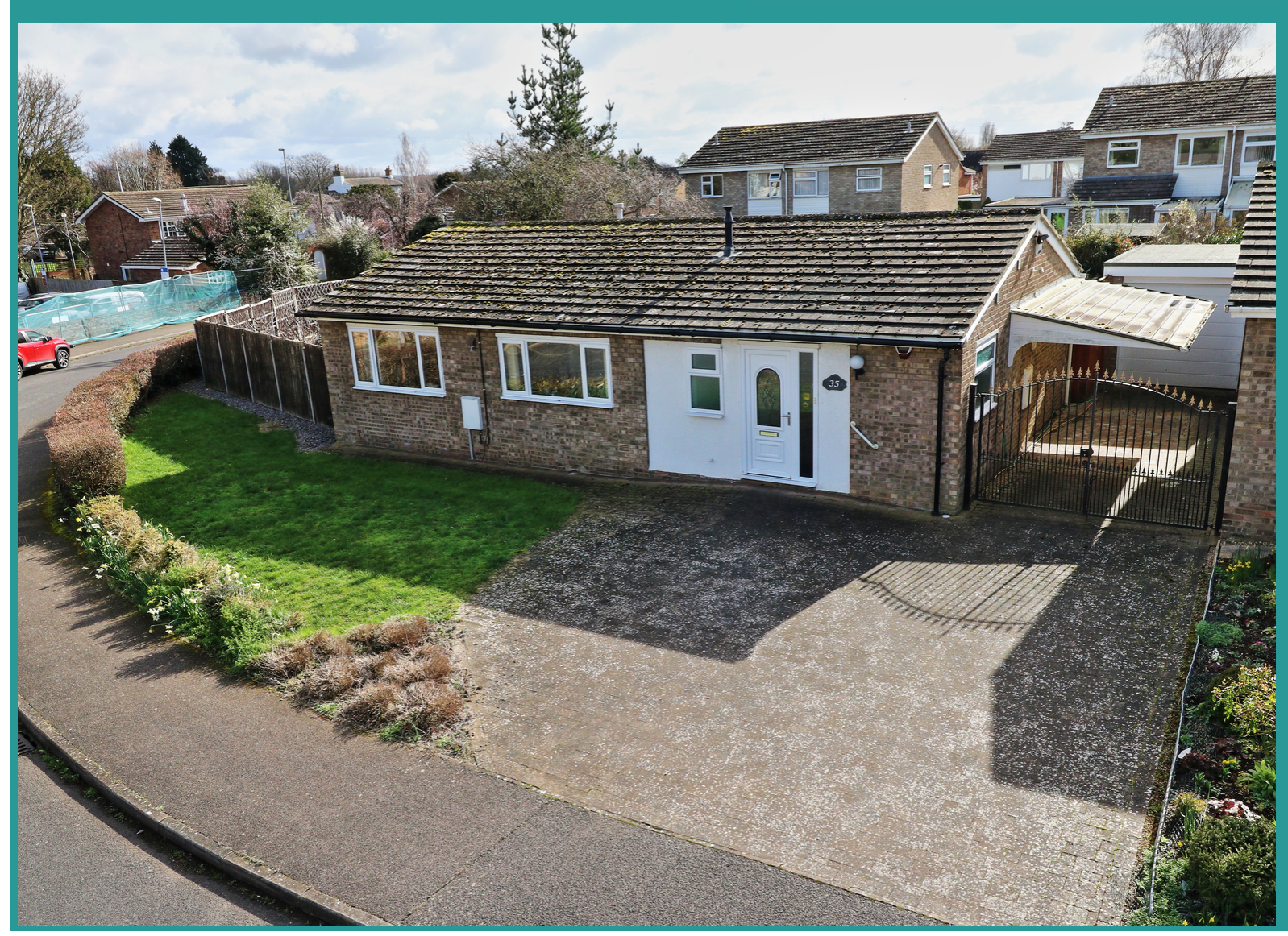
35 Drake Road, Eaton Socon, St Neots, Cambridgeshire. PE19 8HS. OIEO £425,000

A well presented three bedroomed detached bungalow situated in a highly regarded culde-sac location with a large corner plot. The spacious accommodation includes a lounge/dining room, double glazed conservatory, cloakroom, four piece bathroom and a fully fitted kitchen/breakfast room. Outside, there are well tended gardens, a good sized driveway, carport and a single garage. Early internal viewing is strongly advised and there is no forward chain.