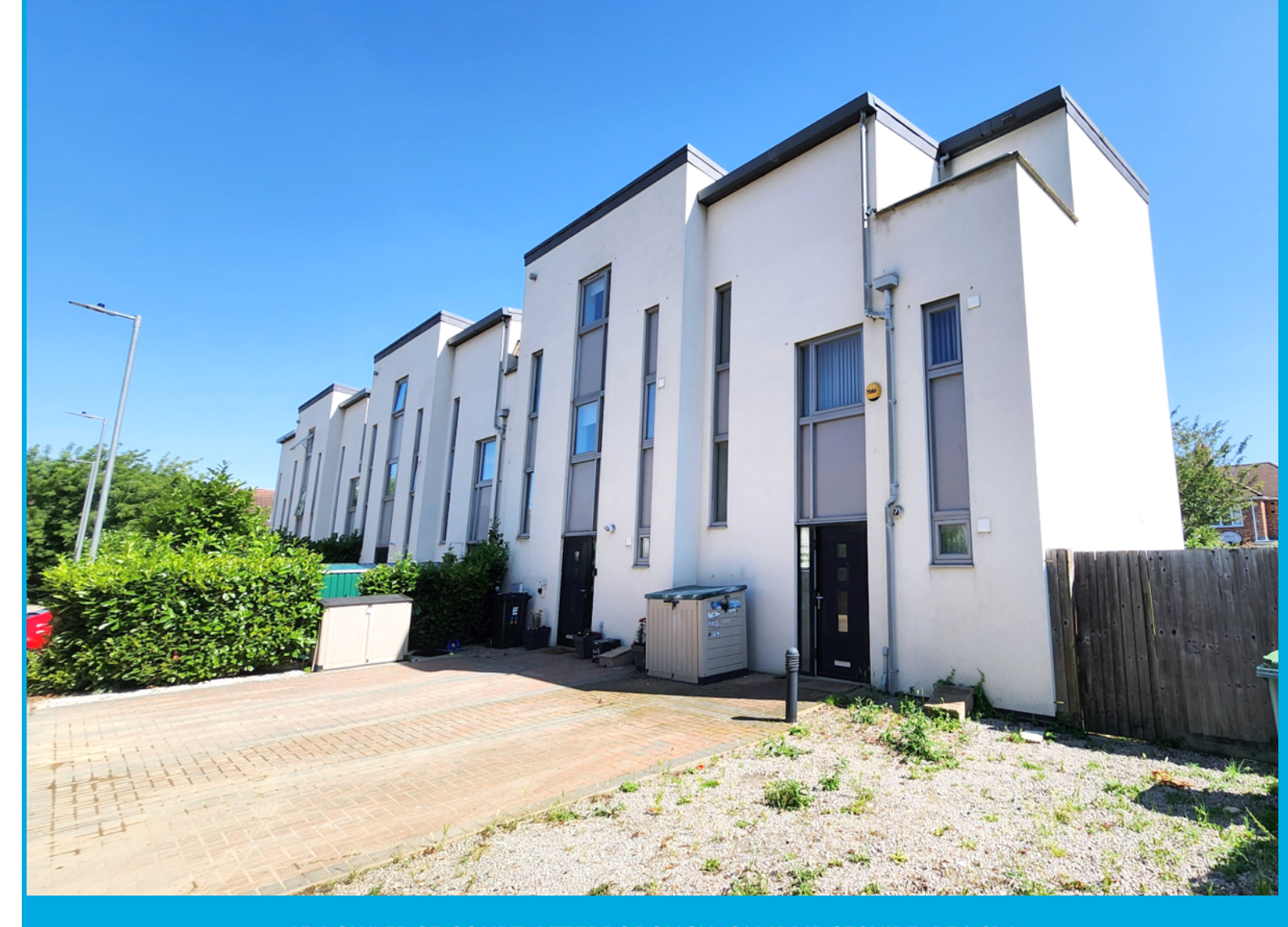
15 ROWLEDGE COURT, PETERBOROUGH, CAMBRIDGESHIRE. PE4 6BA