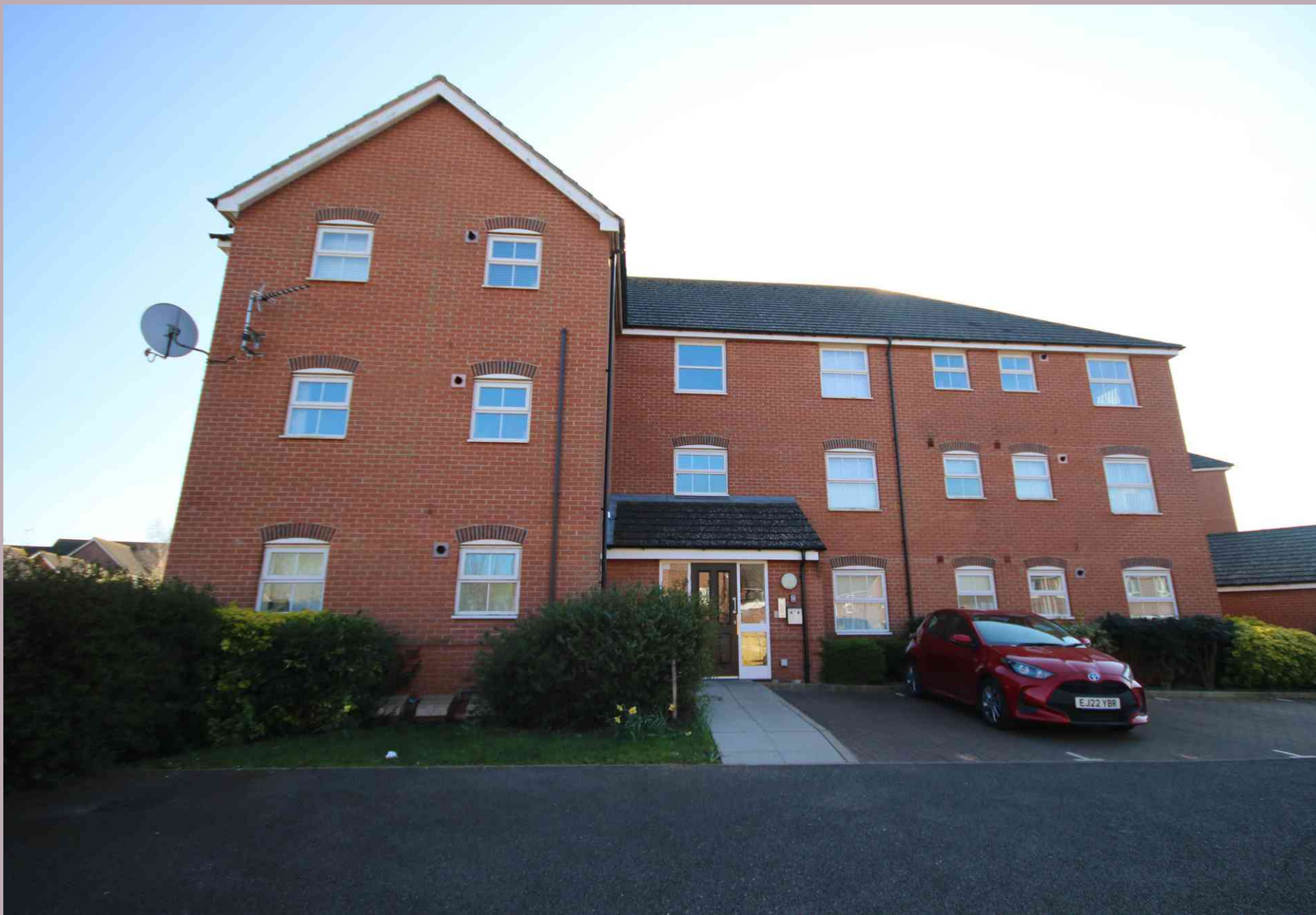
Flat B, 11 Clement Attlee Way, King's Lynn £725 per calendar month