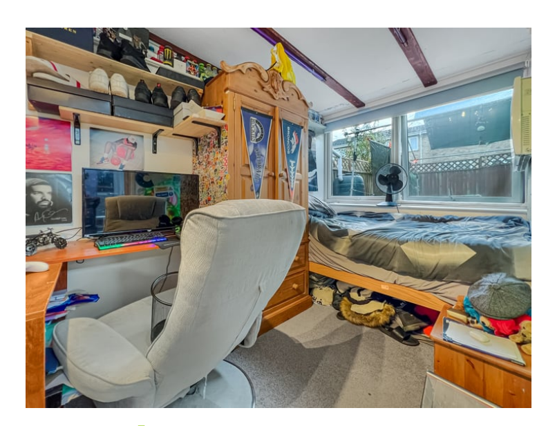
Landing Bedroom One