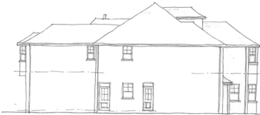
SIDE ELEVATION SOUTH