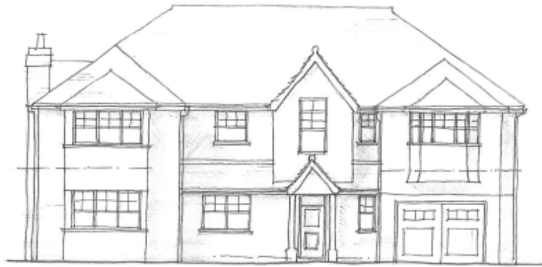
FRONT ELEVATION WEST