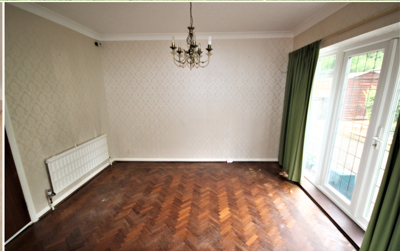
Pheasant Walk Chalfont St Peter, Bucks, SL9 0PW