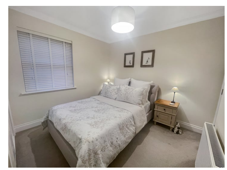
11' \ 03'' \ x \ 10' \ 03'' \ (3.43m \ x \ 3.12m) Double glazed window to front, radiator, fitted wardrobe, door to en-suite.