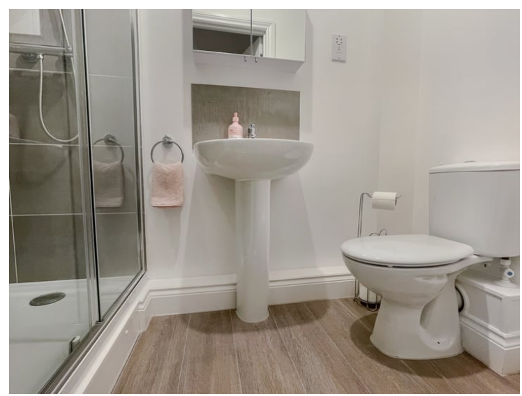
7'~03"~x~3'~10"~(2.21m~x~1.17m) Radiator, tiled splash back, ceiling fan, shower cubical, wash hand basin and low level WC.