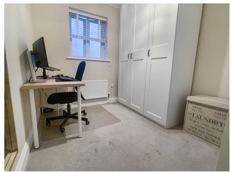
7' 03" x 3' 10" (2.21m x 1.17m) Double glazed window to front, fitted wardrobe, radiator.