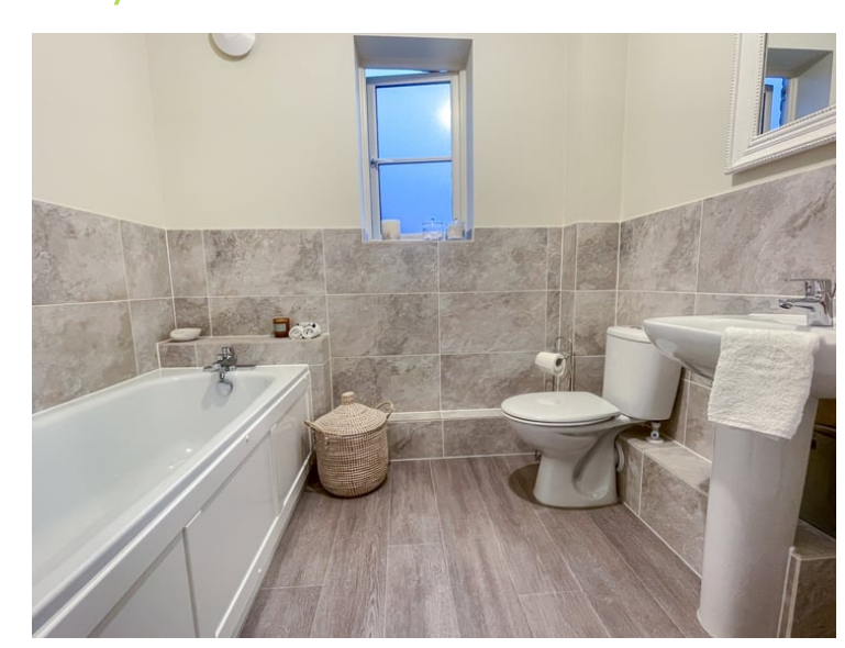
7'~07''~x~6'~03''~(2.31 m~x~1.91 m) Double glazed obscured window to rear, radiator, wall mounted fan, part tiled walls, fitted white suite including panelled bath, low level WC, wash hand basin.