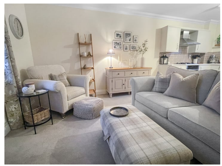
14' \ 0" \ x \ 11' \ 11" \ (4.24m \ x \ 3.63m) Double glazed window to front, radiator, space for furniture.