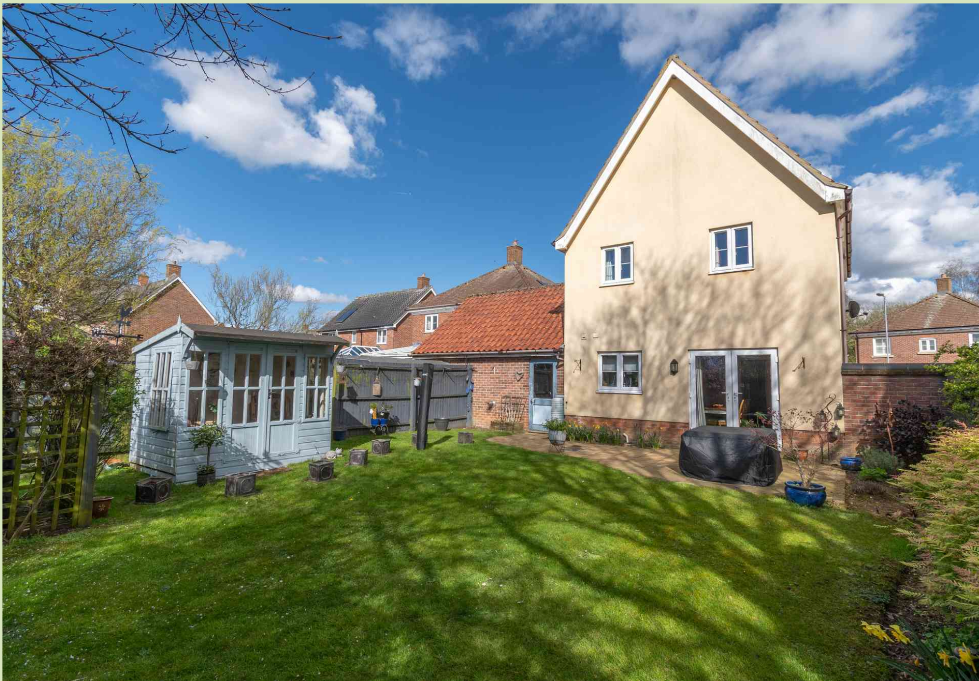
14 Owen Cole Close, Great Massingham Guide Price £395,000