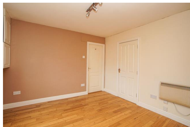
RECEPTION ROOM 2/BEDROOM 3