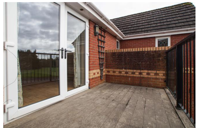
BEDROOM 1, EN-SUITE & BALCONY