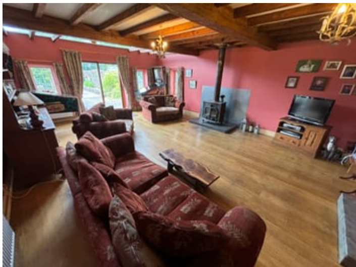
LIVING ROOM (THIRD IMAGE)