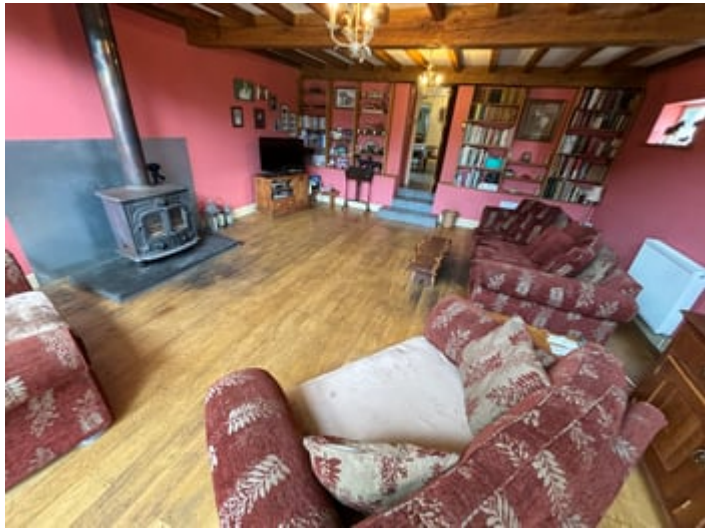
LIVING ROOM (SECOND IMAGE)

24' 5" x 17' 6" (7.44m x 5.33m). A fantastic Family room with part vaulted ceiling, patio doors opening onto the terraced walled garden, large cast iron multi fuel stove on a slate hearth with stainless steel splashback, three radiators.