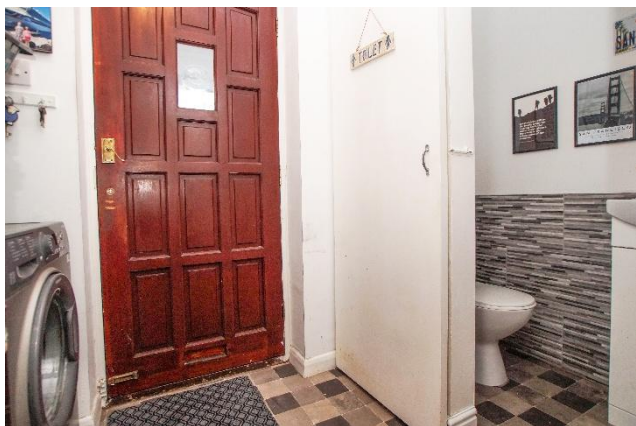
UTILITY & CLOAKROOM

CLOAKROOM (5' x 3') Two piece suite comprising WC and sink basin with mixer tap and tile effect vinyl flooring.