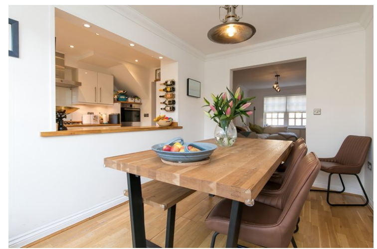
11' 3" x 8' 2" (3.43m x 2.49m) Double glazed timber French doors to rear, radiator, solid oak wood floor, open plan serving worktop space.