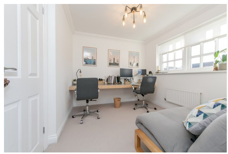
9'10" \times 8'11" (3.00m x 2.72m) With window to rear, radiator, built in wardrobe.