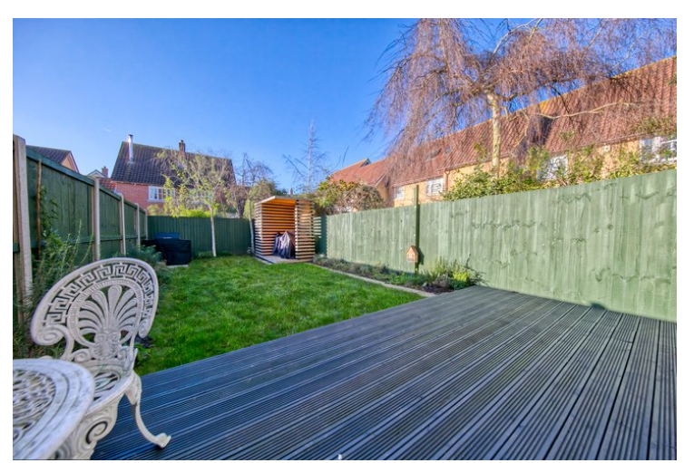
A well maintained south/west facing garden enclosed by privacy fencing with a lawn area leading to a raised decking area with space for outdoor dining furniture, a paved space to the rear allowing a further patio area or hard standing for shed, timber cladded storage unit, two silver birch trees and shrubs.