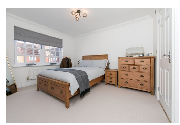
9'10" \times 8'11" ( 3.00m \times 2.72m ) Two double glazed sash window to front, radiator, built in wardrobe, door to en-suite, space for double bed and furniture.