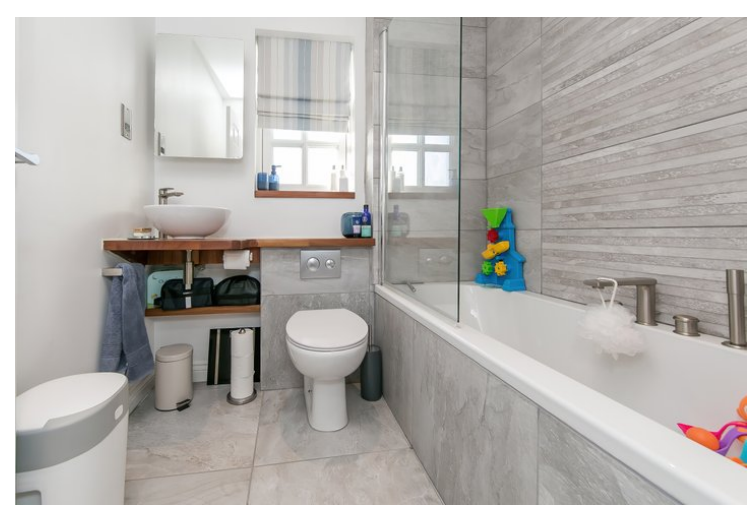
Obscured double glazed timber sash window to rear, tiled floor heated towel rail, inset spot lights, close coupled WC, wash hand basin with solid wood counter top, tiled panelled bath with over head shower and separate pull out hand shower head.