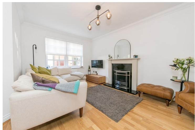
15^{\circ} 0" x 13^{\circ} 8" (4.57m x 4.17m) Double glazed sash timber window to front, radiator, solid oak wood floor, gas feature fireplace with granite hearth, storage cupboard, opening to dining room and kitchen.