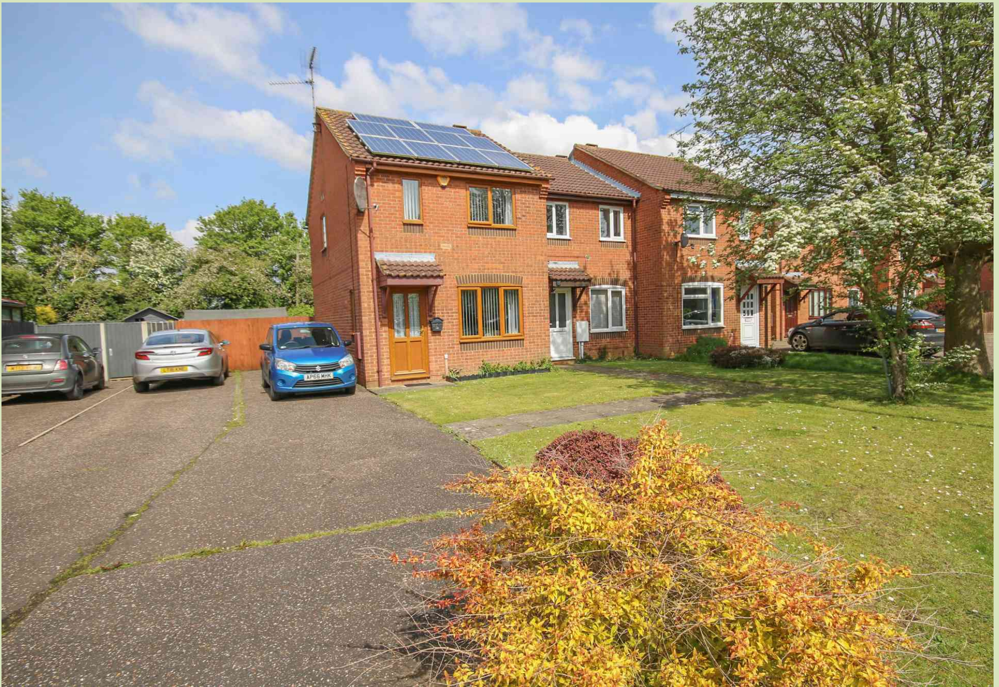
23 Bure Close, Watlington Guide Price £230,000