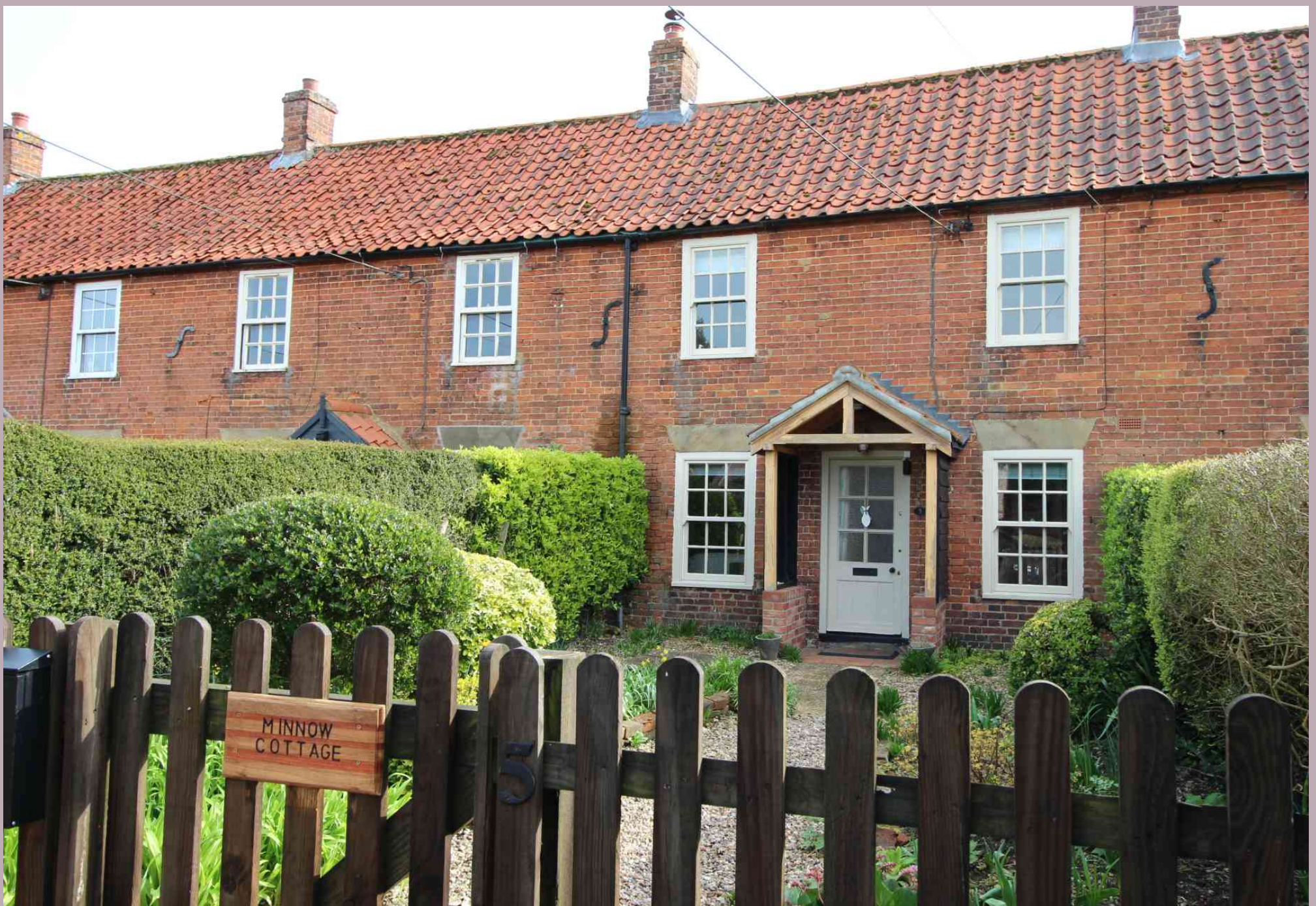
Minnow Cottage, Docking £950 per calendar month