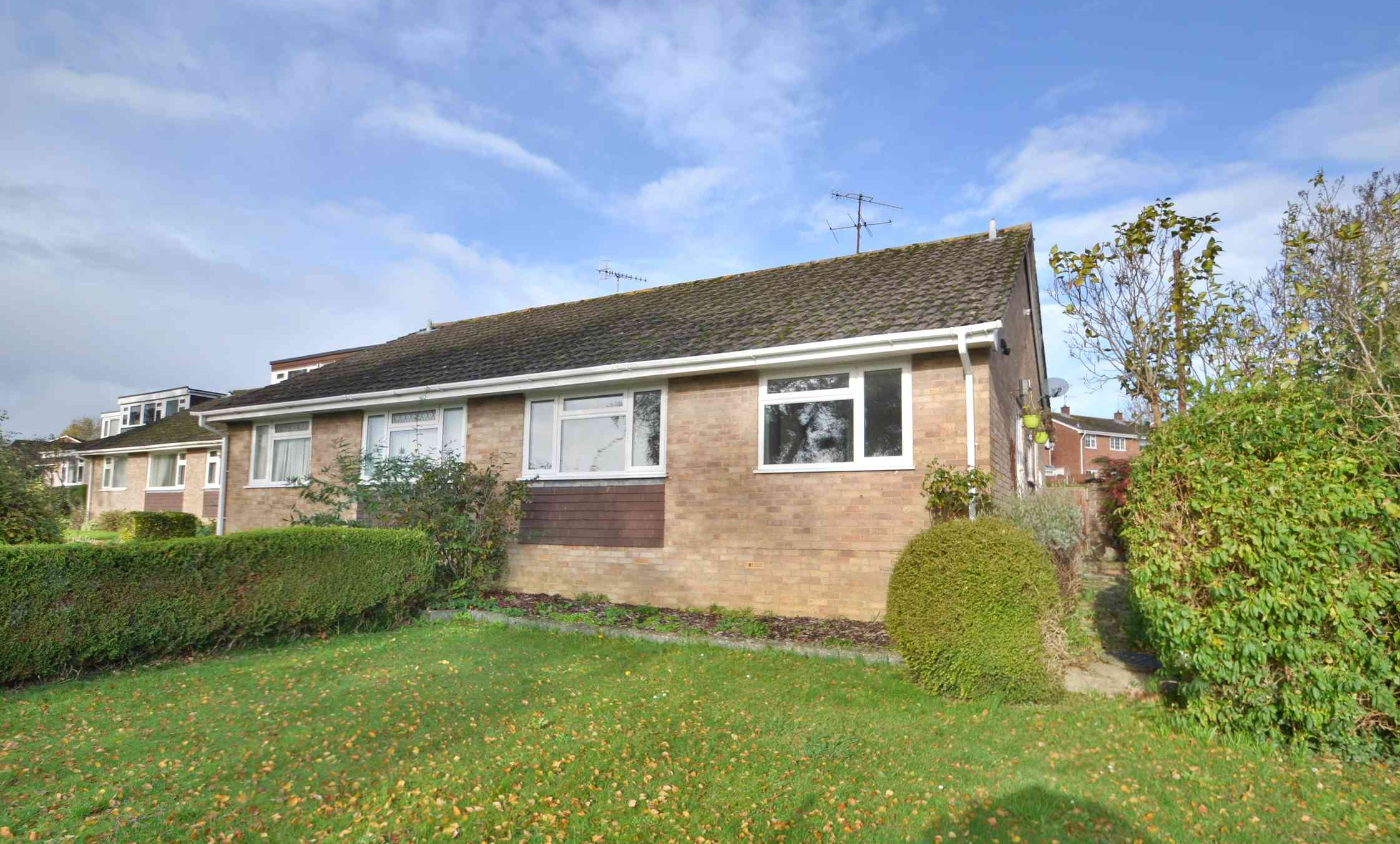
1 The Stirrup, Cashes Green, Stroud, Gloucestershire, GL5 4SG £325,000