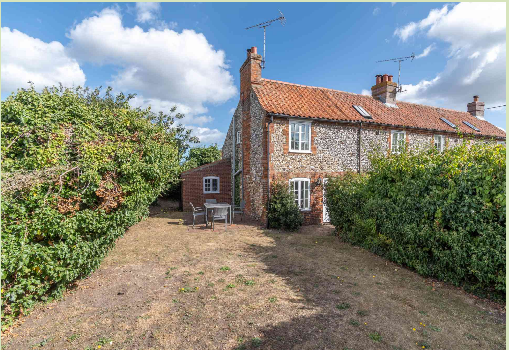
End Cottage, Burnham Market Guide Price £350,000