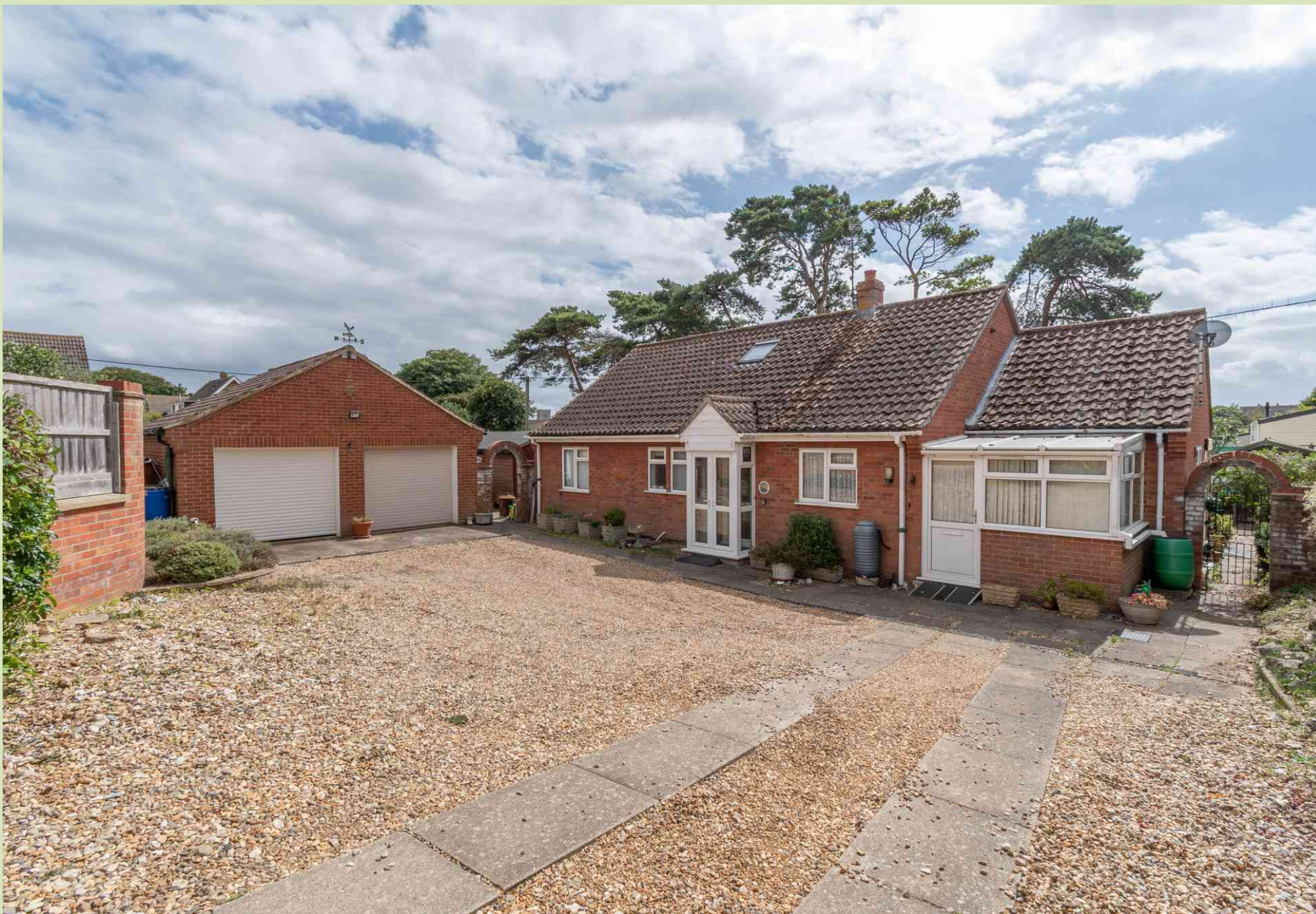
Burnsall, Wells-Next-the-Sea £650,000