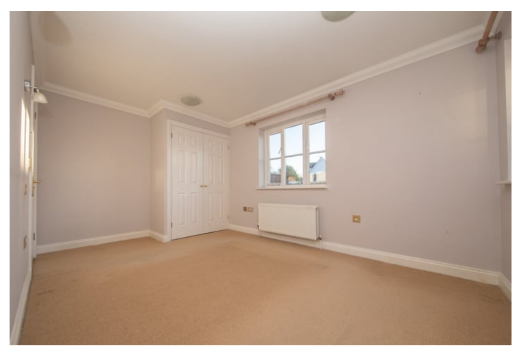
14' 7" x 9' 5" ( 4.45m x 2.87m ) UPVC double glazed windows to front and side, built-in wardrobes, radiator, door to en suite.