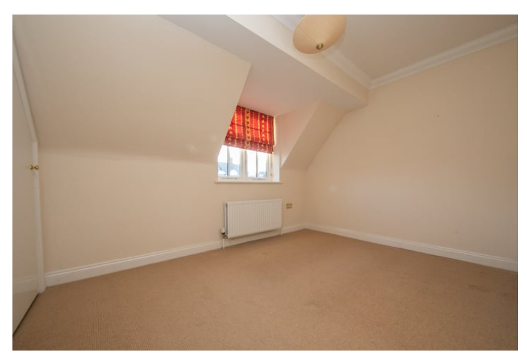
11'11" x 8' 5" (3.63m x 2.57m) Double glazed window to front, side, radiator fitted wardrobe.