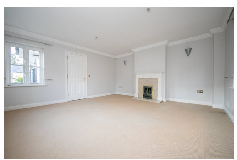
16' 2" x 14' 11" (4.93m x 4.55m) Double glazed sash windows front and sides, radiator, feature fireplace.