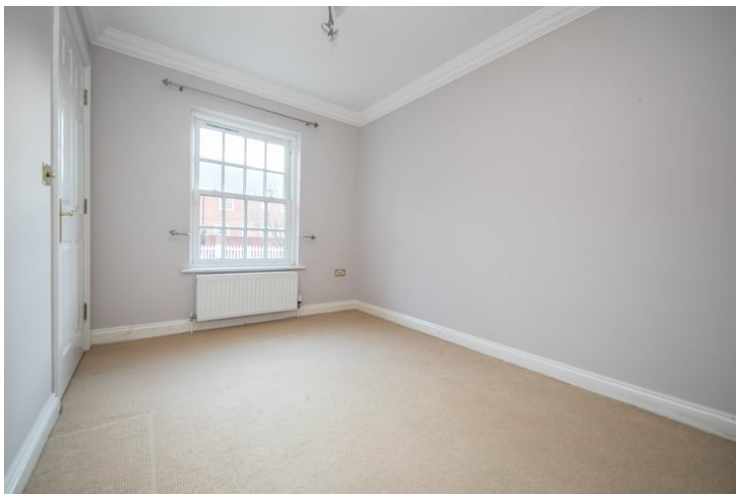
11' 4" x 8' 5" (3.45m x 2.57m) Double glazed sash window to front, radiator.