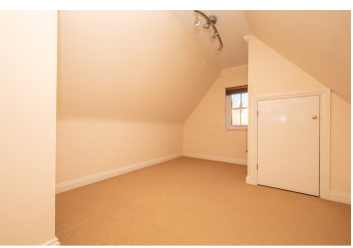
13'01" x 9'11" (3.99m x 3.02m) Double glazed window to rear, storage, radiator.