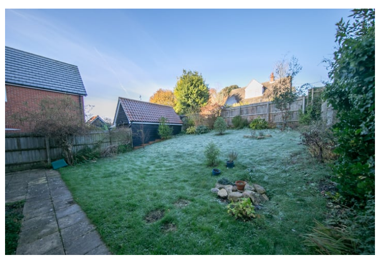
Mainly laid to lawn, patio area, retained by fencing, shrubs and trees, side acess.