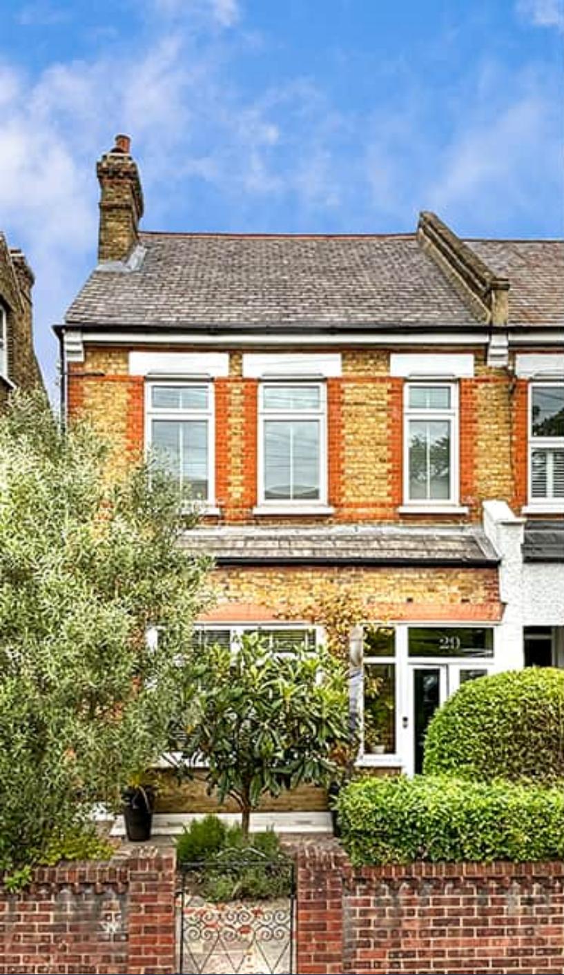
£980,000 Freehold 4 bedroom semi-detached house