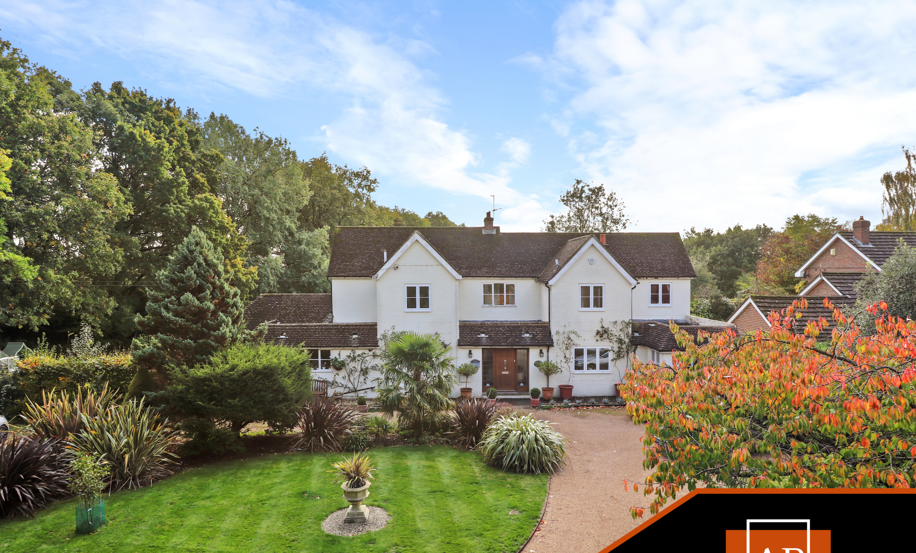
Hollygrove Cottage, Allington Road, Newick, Lewes, East Sussex BN8 4NH