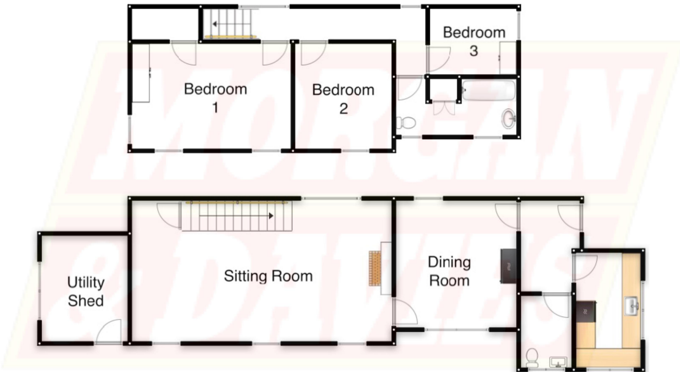
Dolhawn SA44 6AS For illustrative purposes only, not to scale