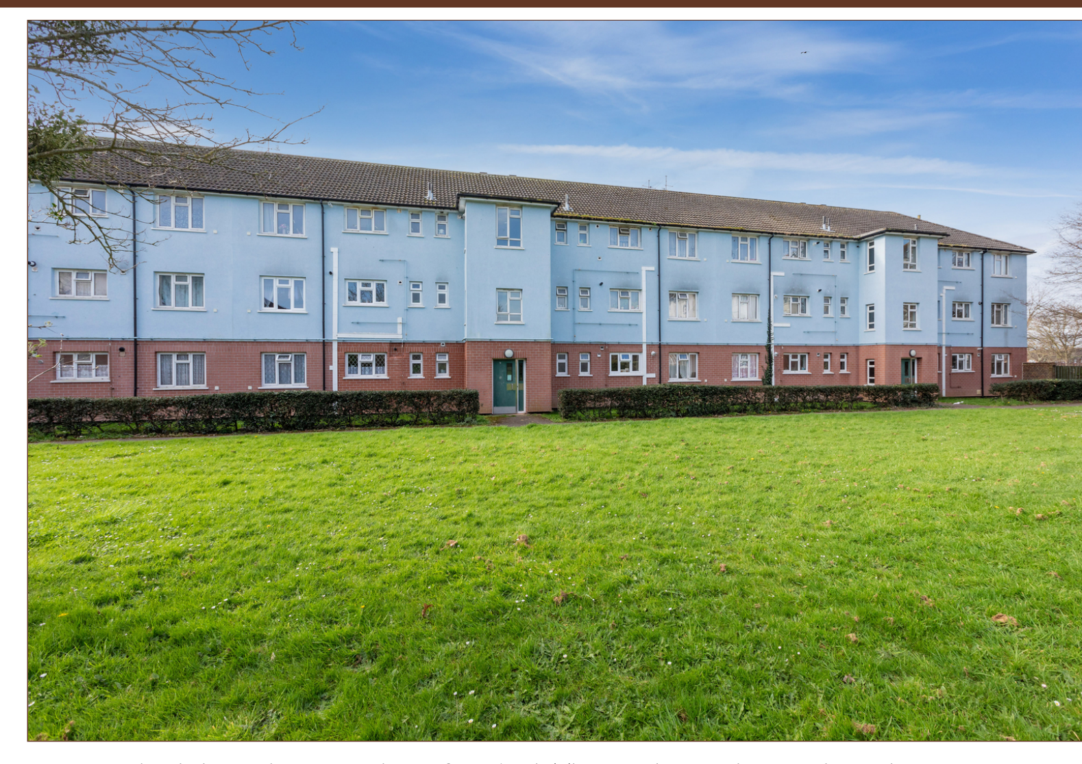
Conveniently located a stones throw from both The Langley Academy and Langley Grammar School, this three bedroom second floor apartment enjoys delightful balcony views overlooking Kedermister Park.

The property stretches an impressive 730 square ft. and comprises a spacious entrance hallway leading to the main bathroom and three good size bedrooms with a range of integrated storage.