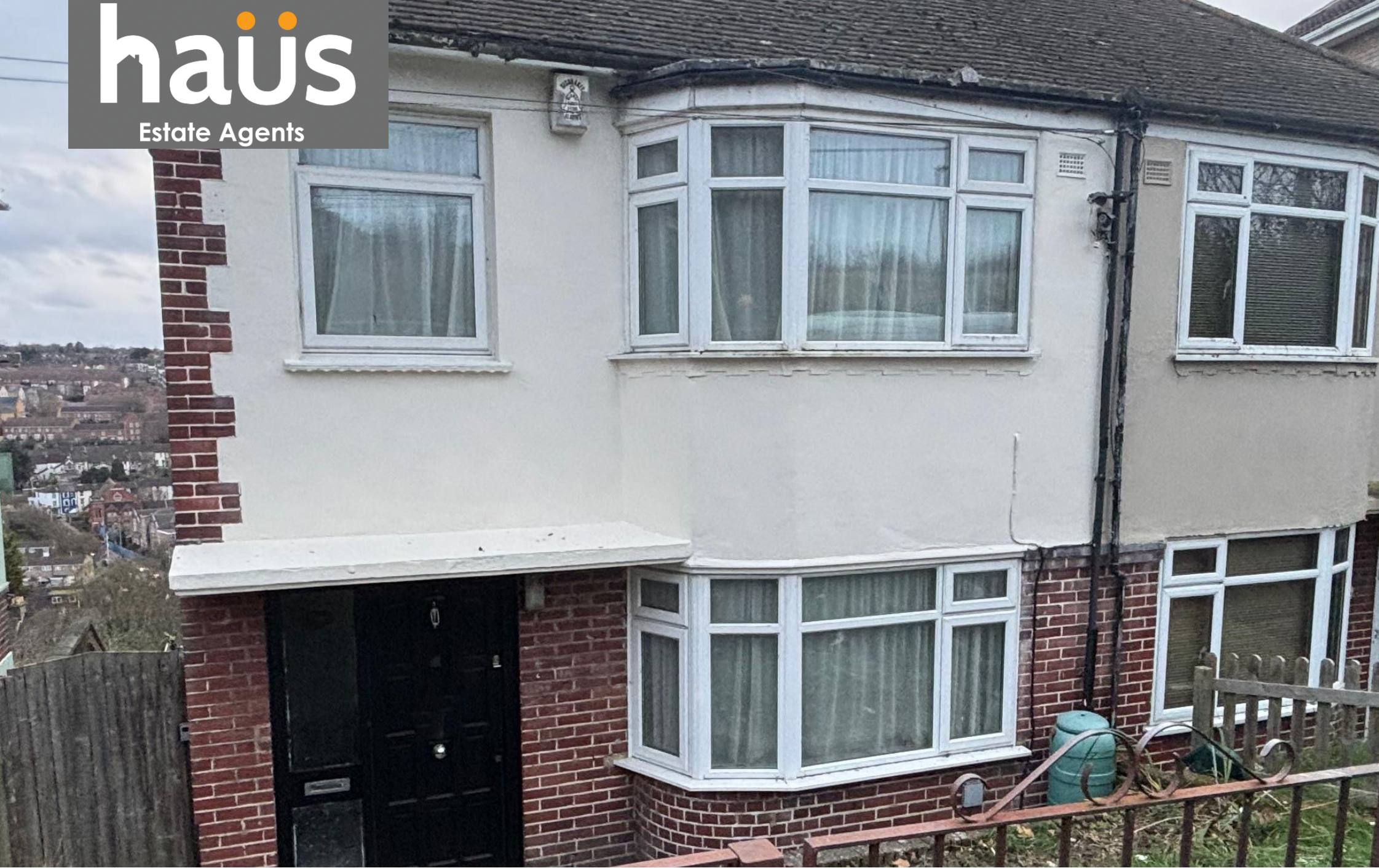
Three Bedroom Semi-Detached House Longhill Avenue, Chatham, Kent, ME5 7AR