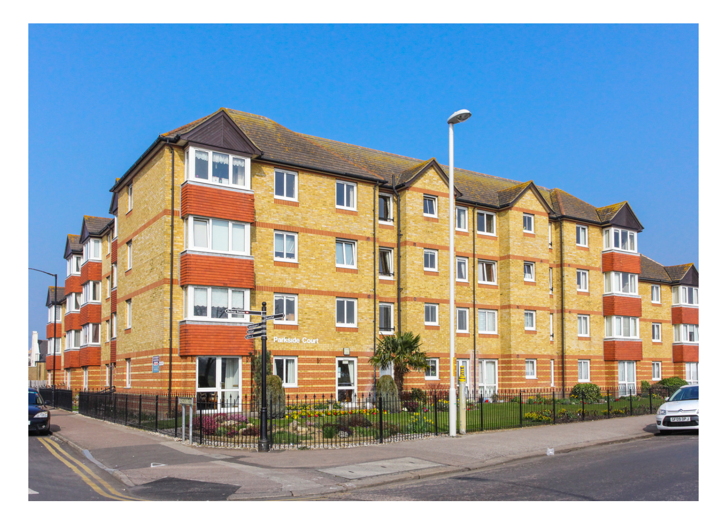
Flat 23 Parkside Court, Kings Road, Herne Bay, Kent, CT6 5RP