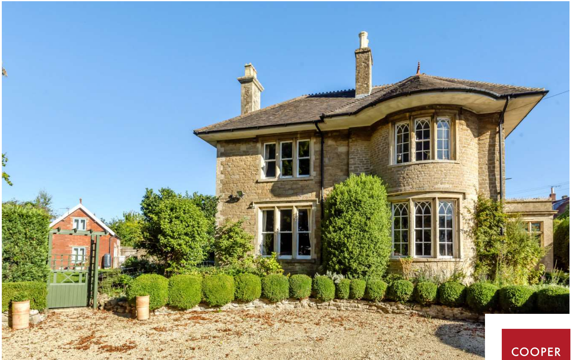
The Limes, 45 Keyford, Frome, BA11 1LB