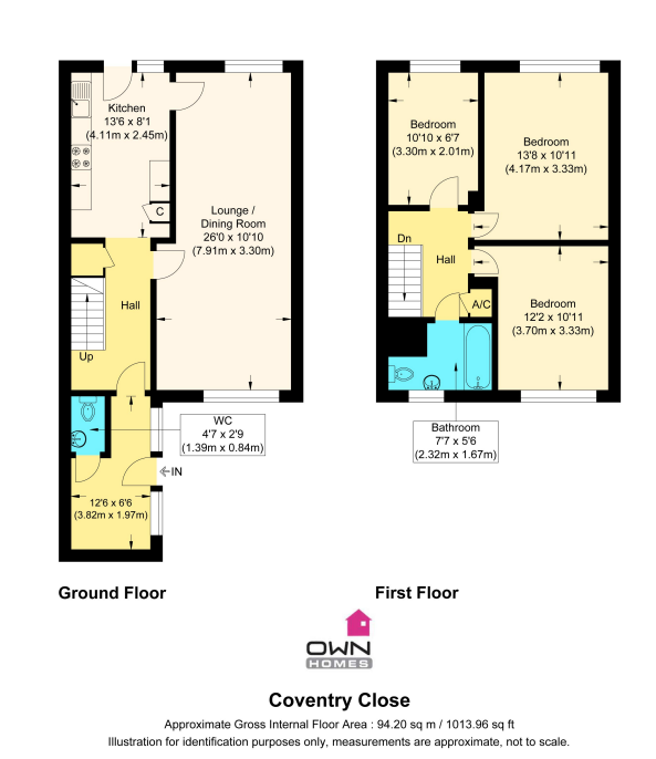
Illustration for id