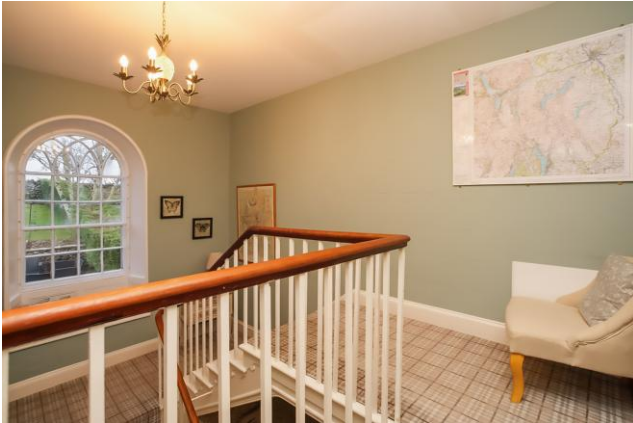
LANDING & FEATURE WINDOW

LANDING Wide staircase with wooden banister, radiator and feature arched Georgian sash window to the rear.