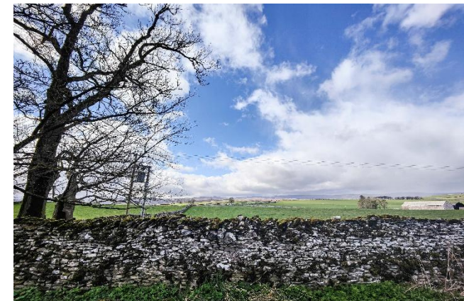
VIEW TO THE REAR