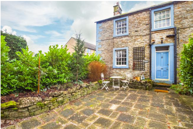
FRONT OF THE PROPERTY