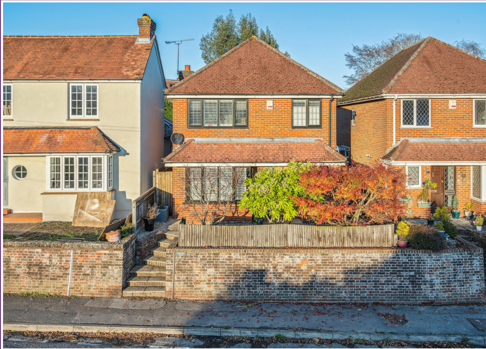
Heathfield House, Gold Hill North, Chalfont St Peter. SL9 9JF.