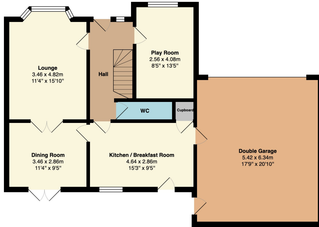
Ground Floor Area: 98.6 m 2 ... 1062 ft 2