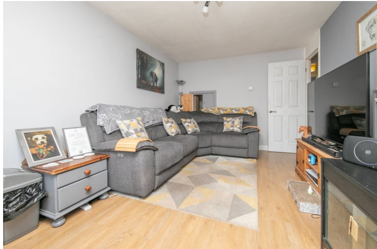
14' 4" x 9' 10" (4.37m x 3m) Double glazed windows to front and radiator.