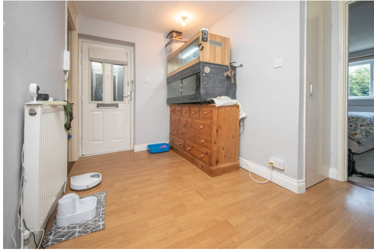
Entrance Hall with door, storage, loft access and doors to;