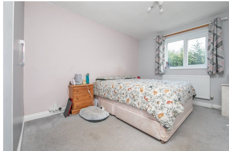
13' 5" x 9' 9" (4.09m x 2.97m) Double glazed window to side, radiator and fitted wardrobes.