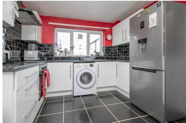
11' 9" x 9' 10" (3.58m x 3m) Double glazed window to side, radiator, fitted kitchen with laminate worktops and a range of wall and base units, sink with right hand drainer, cooker and hob, over head cooker hood, space for washing machine, dishwasher and fridge/freezer.