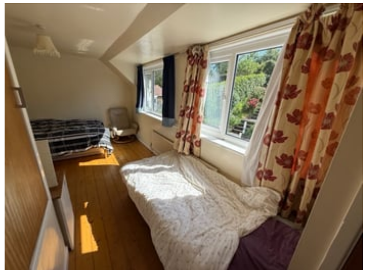
Rear Double Bedroom 3

12' 0" x 12' 0" (3.66m x 3.66m) with dual aspect windows to front and side, again with lovely sea views, central heating radiator. Built in cupboard.