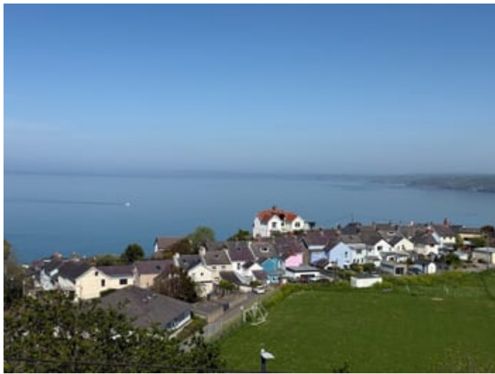
Front Double Bedroom 2