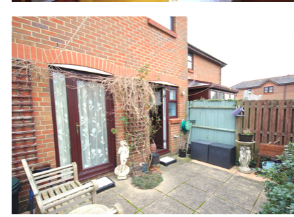
42 Colborne Close, Baiter Park, Poole, Dorset BH15 1US