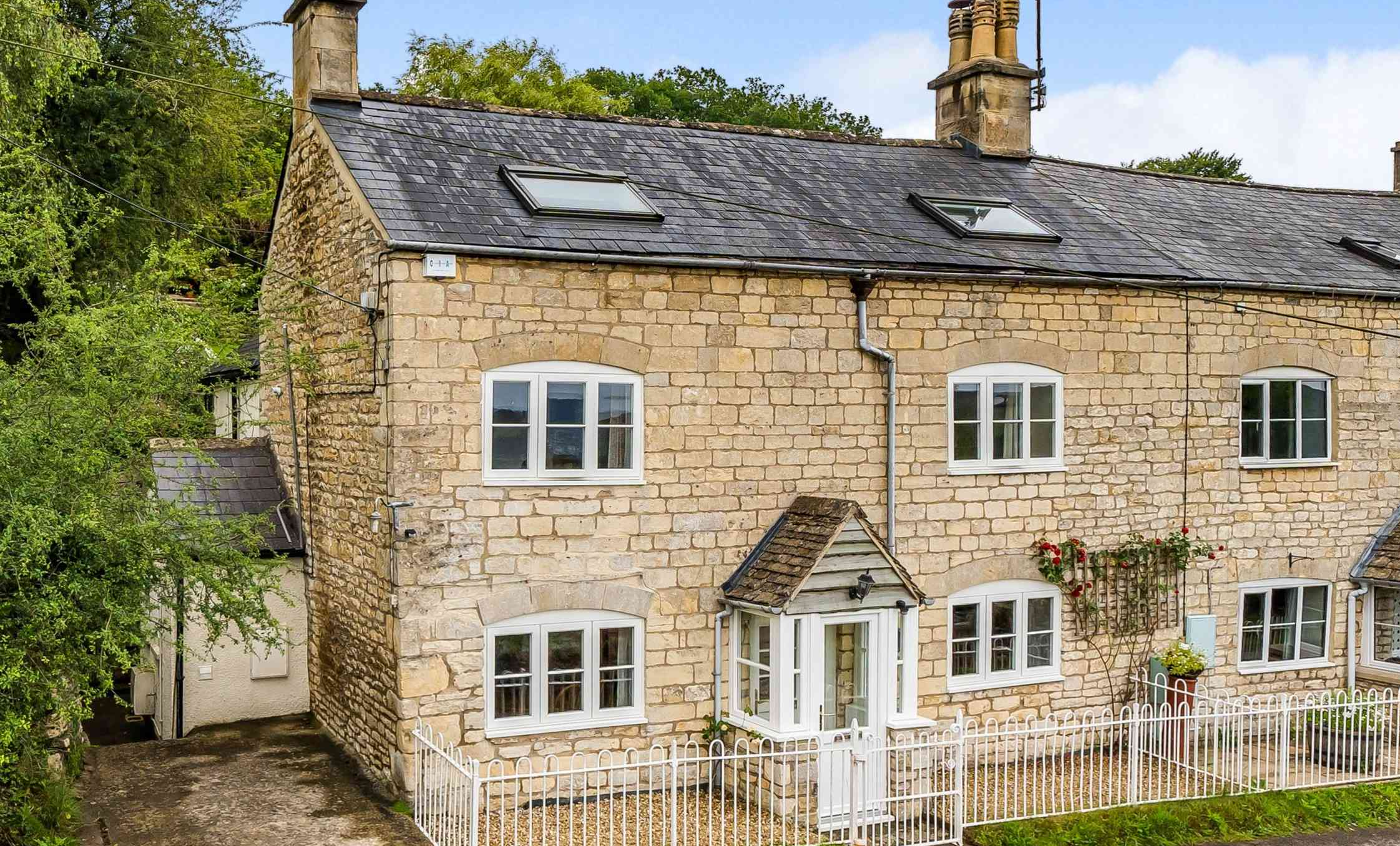
Hope Cottage, Lower Littleworth, Amberley, Gloucestershire, GL5 5AN Price Guide £725,000