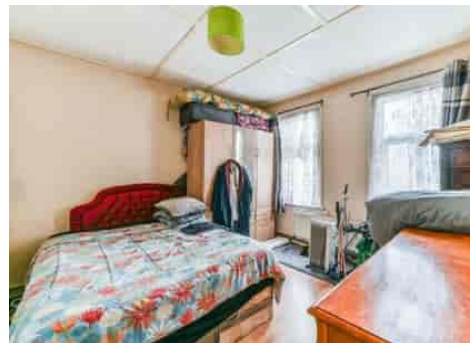
Fairholme Road, Croydon, Surrey, CR0 3PD