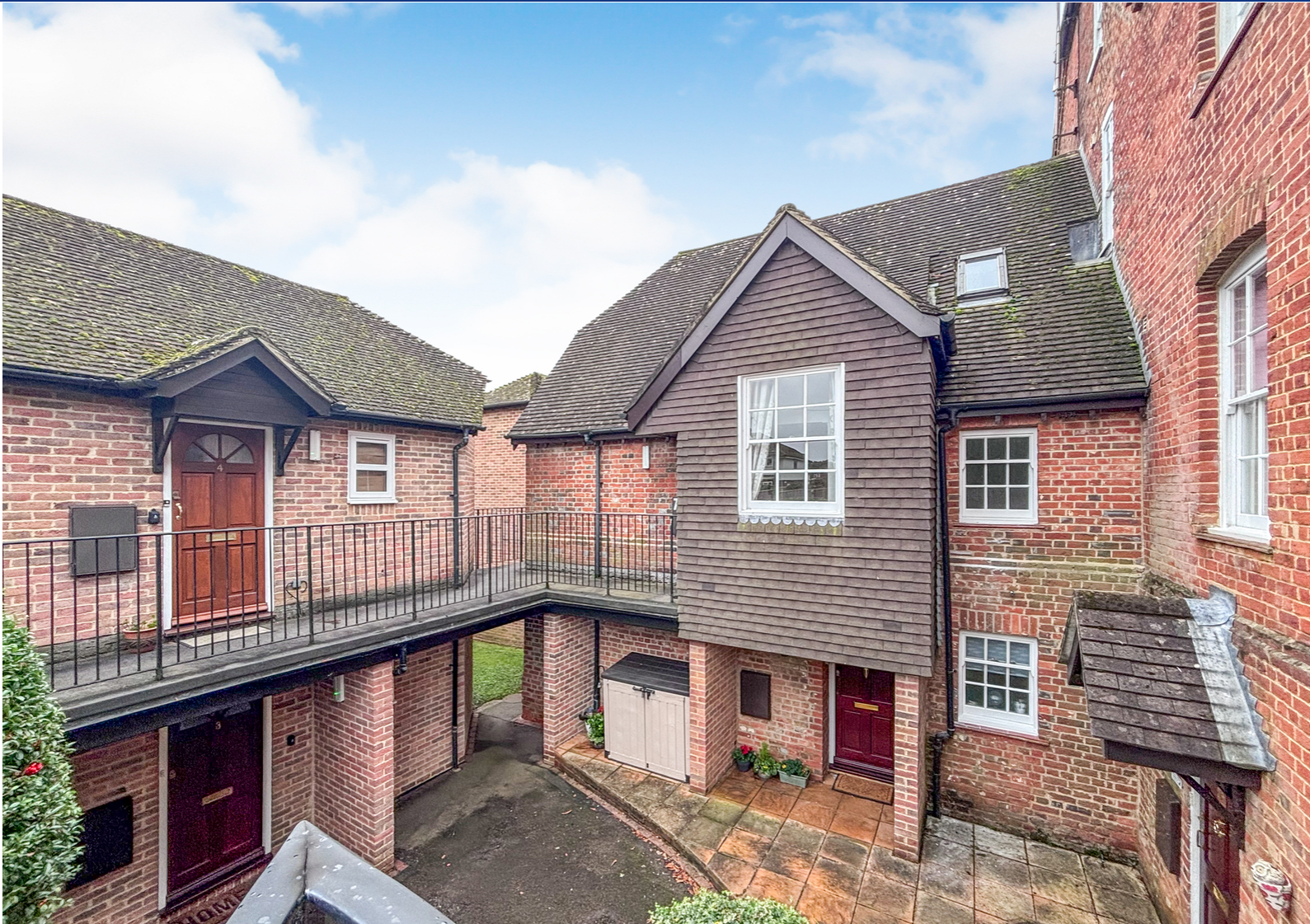
Southcote Lodge, Burghfield Road, Reading.