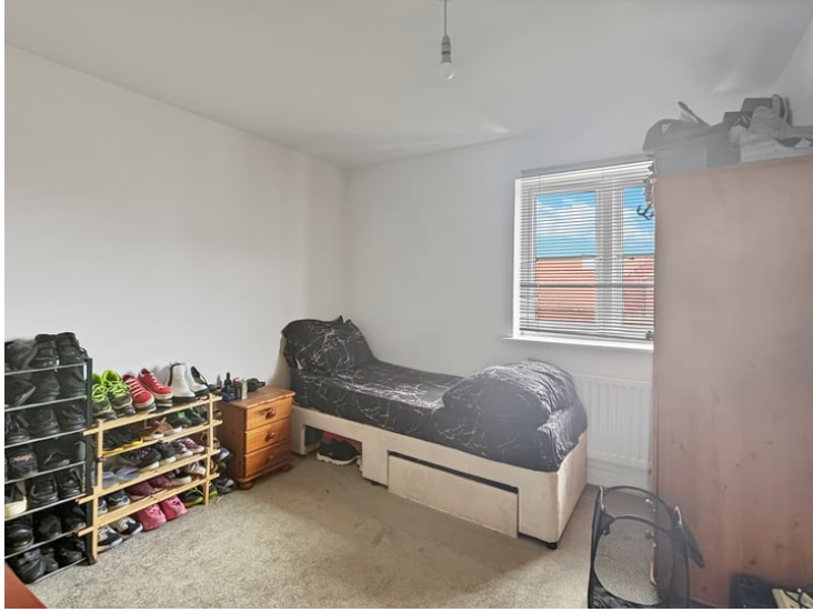
12' 11" x 9' 0" (3.94m x 2.74m) Double glazed to front, radiator, storage cupboard.