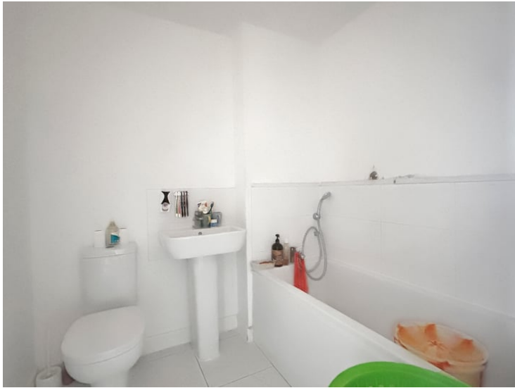
6' 8" x 6' 2" (2.03m x 1.88m) Tiled floor, ceiling fan, low level WC, wash hand basin, ceiling extractor fan.