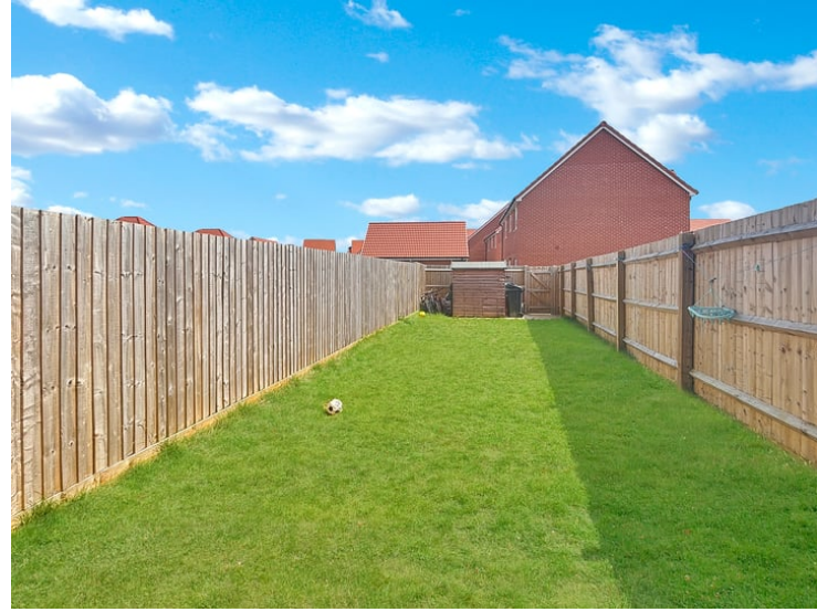
A well maintained rear garden laid to lawn, patio area, garden shed, retained by fencing, rear access to the drive way,