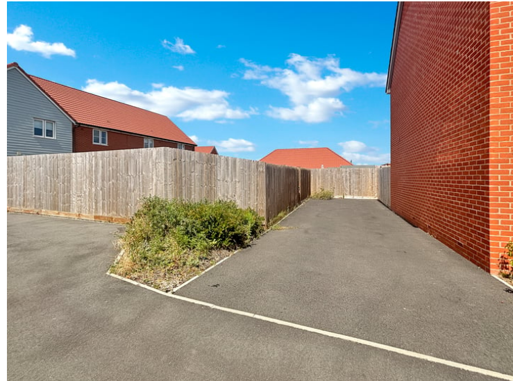
Ample off road parking to the rear of the property.