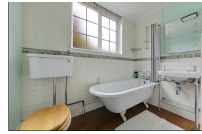
White suite comprising roll top claw feet bath with over head shower, low level W.C., wall mounted wash hand basin, localised tiling, wood floors. Airing cupboard housing electric boiler and hot water tank, chrome heated towel rail, radiator, opaque double glazed window to rear.