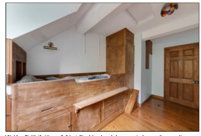
12^{\prime} 1" x 7^{\prime} 8" (3.68m x 2.34m) Double glazed dormer window to front, radiator, restored cabin bed from decommissioned ship with built in storage. wood floors, eaves storage.