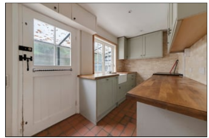
11' 11" x 6' 4" (3.63m x 1.93m) Fitted with Shaker style wall and base units, wood worktops, butler sink unit, integrated dishwasher, larder, door to lean to with plumbing for washing machine, quarry tiled floor,