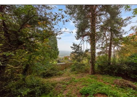
LIMEBANK COTTAGE, STAR HILL ROAD, SEVENOAKS, KENT TN14 6HA

Dating back to 1840 with a later addition in 1994, character 4 bedroomed semi detached cottage which boasts a third of an acre plot. There is side access which leads to an incredible elevated and tiered garden which offers so much potential and the most incredible southerly views. There are quirky character features, inbuilt storage and adaptable accommodation with off street parking to front.