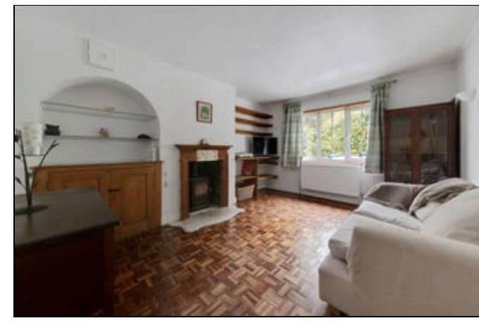
14' 1" x 11' 11" (4.29m x 3.63m) Double glazed window to front, radiator, fireplace with wood burning stove, marble hearth and wood surround, parquet flooring.