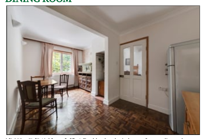
15^{\circ} 11" x 8' 5" (4.85m x 2.57m) Double glazed window to front, radiator, door to sitting room and kitchen, fireplace, parquet flooring, radiator.