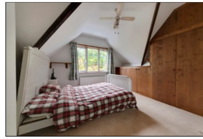
13^{\circ} 6" x 11^{\circ} 11^{\circ} (4.11m x 3.63m) Double glazed dormer window to front, radiator, built in wardrobe and storage.