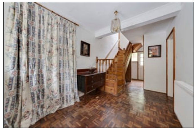
Parquet flooring, stairs to first floor, understairs storage area, doors to garage, dining room, study and rear garden, radiator, open to rear lobby and utility.