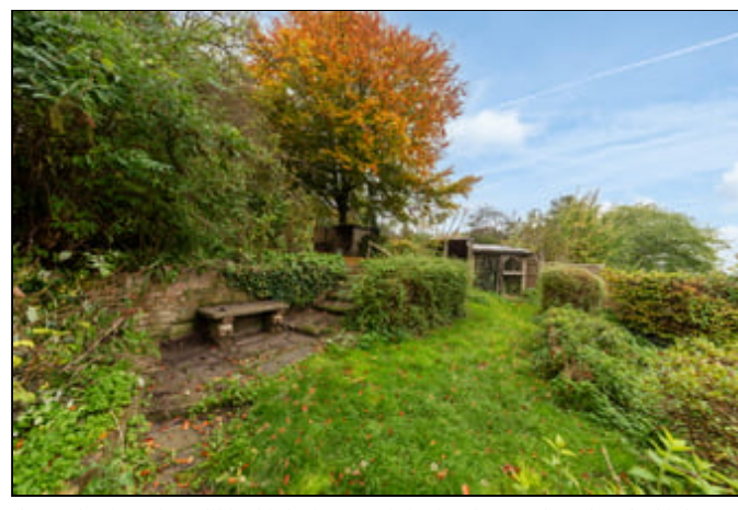
The garden is an incredible third of an acre it is tiered upwards and at the highest plateau the views are incredible.