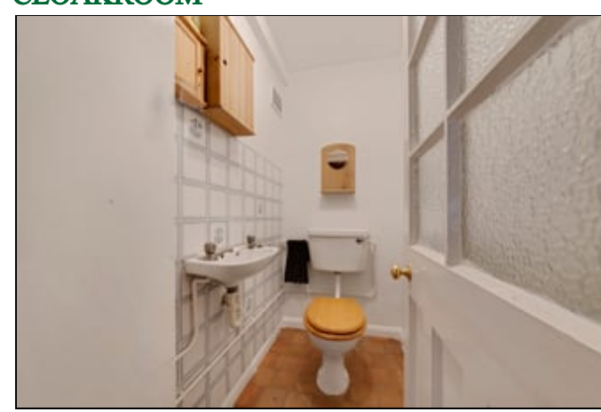
Low level W.C., tiled splashback, wall mounted wash hand basin, quarry tiled floor