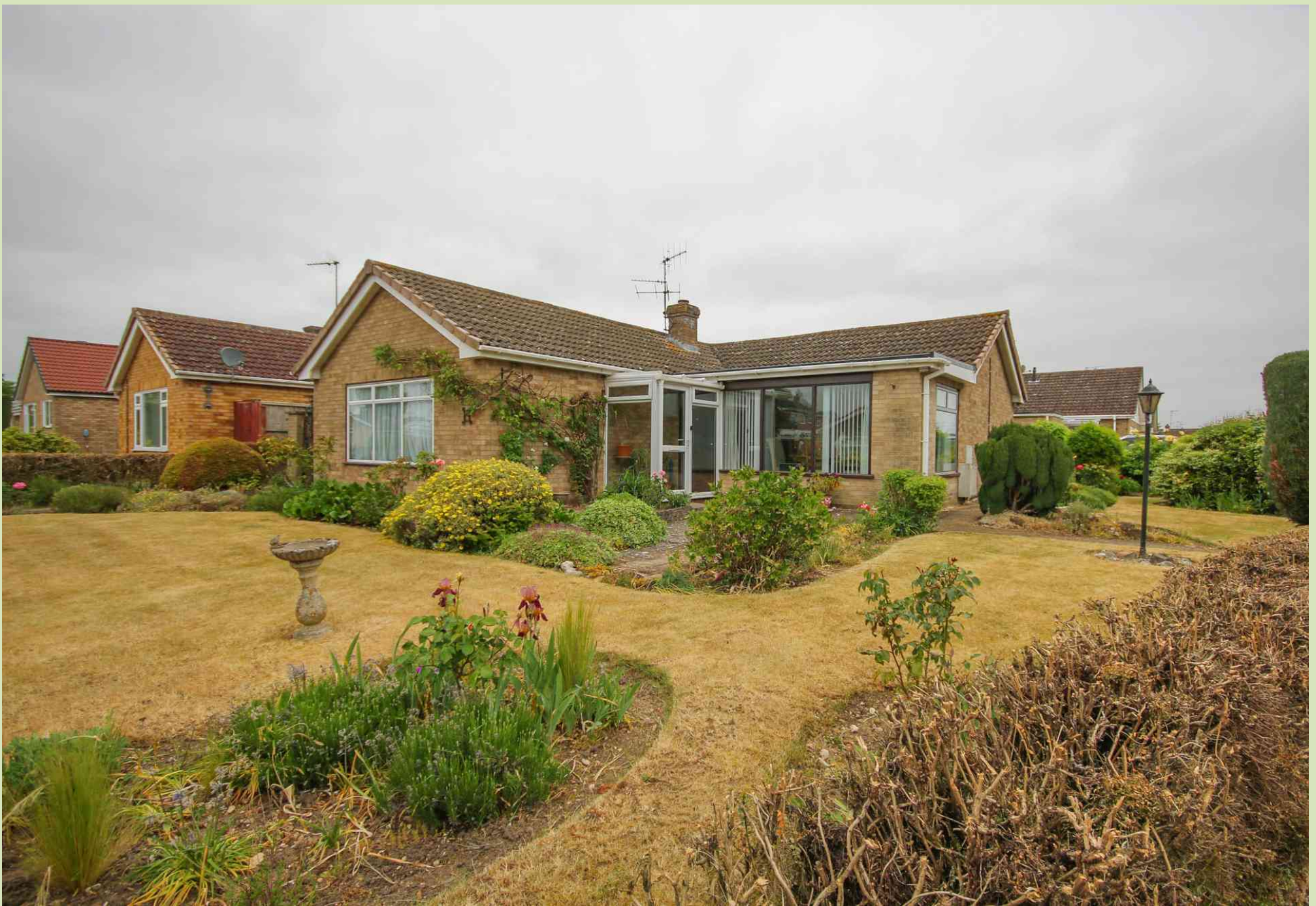
19 Pine Tree Chase, West Winch Guide Price £295,000